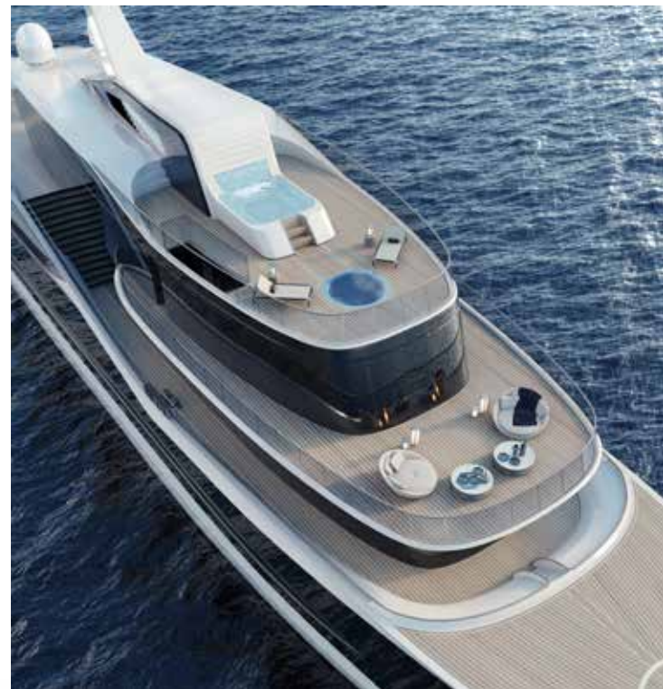
Pictured here a sketch and renderings (above) of Progetto Bolide a radical 72m luxury superyacht designed for Tankoa and sparked by the desire to create something unique